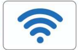
WI-FI ENABLED CAMPUS