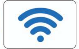
WI-FI ENABLED CAMPUS