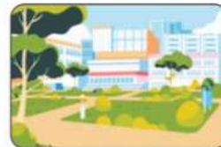
LUSH GREEN CAMPUS