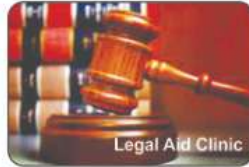
LEGAL AID CLINIC